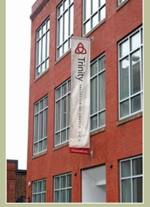
Trinity Presbyterian Church in Providence RI

"To take hold of New England for Christ requires church planting."